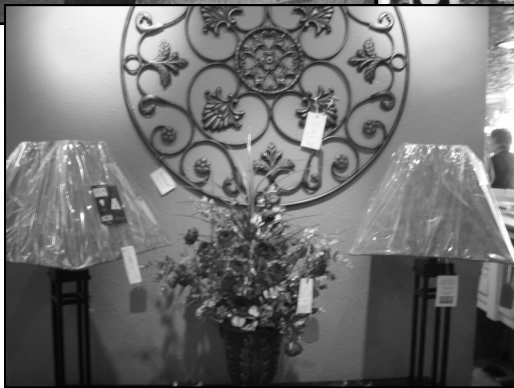
Bottom Left: Unique Lighting & Home Décor draws a big crowd for their 2nd Anniversary Sale & Social!